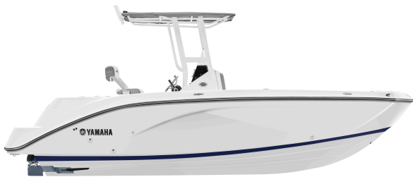
220 FSH® Sport